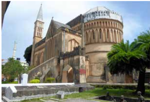
Christchurch Cathedral, Zanzibar - built over the slave market, with the slave memorial in the foreground

He was perhaps a failure as a missionary – he only managed one conversion to Christianity. But his work with the slave trade was an enormous ministry and Livingstone is held with great affection throughout Africa today.