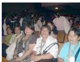
ECP women at the Forum.

Plenary Sessions looked at: Feminism through Generations; An Agency for Women in the UN, at Last!; Gender in Climate Change and Disaster Risk Reduction; Gender and Human Security in Situations of Conflict and Post-Conflict; Forging Ahead with Development.